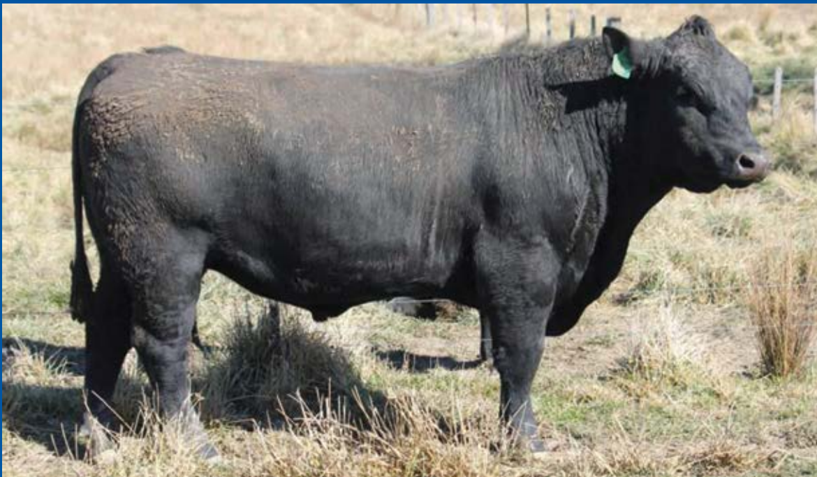
LOT 47 Wakefield Geddes ANN21S767