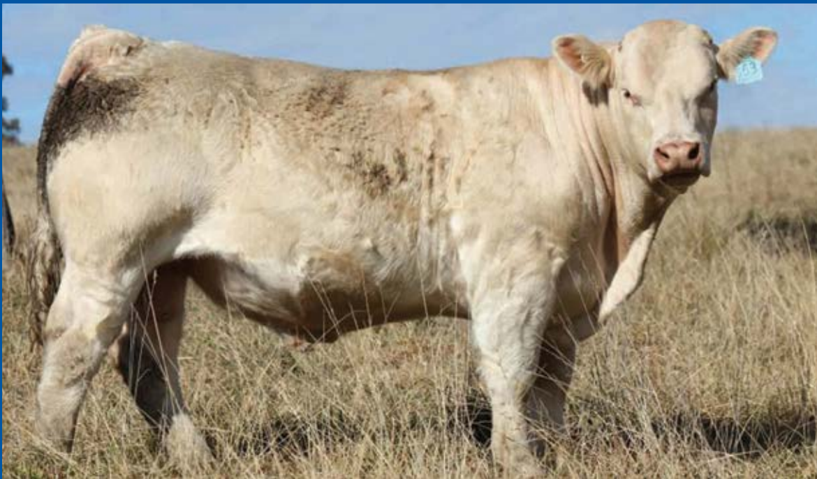
LOT 13 Wakefield Stone The Crows (P/S) BIS S53E