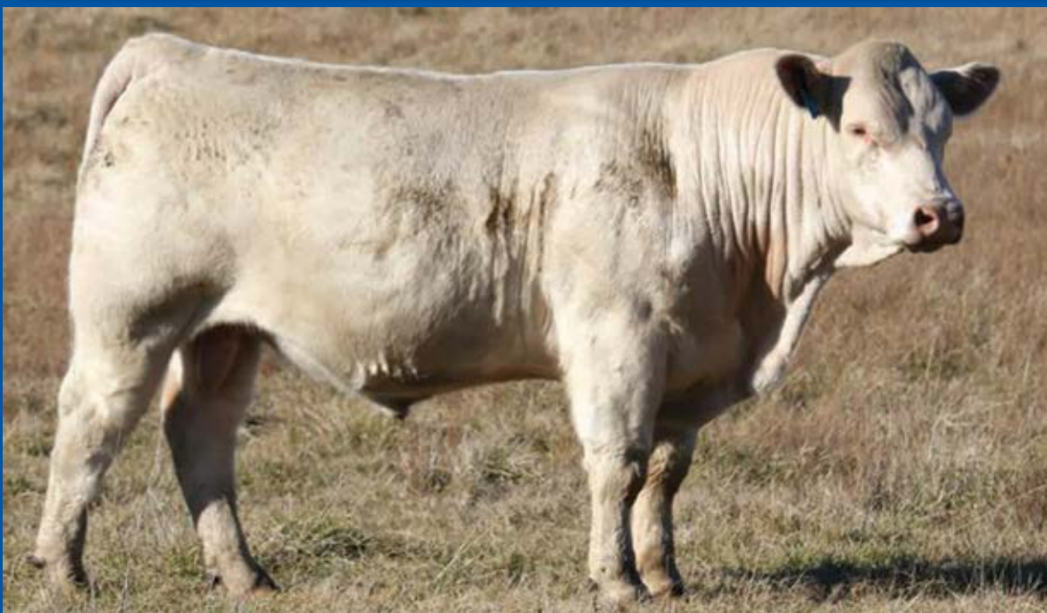
LOT 11 Wakefield Sterling (P) BIS S52E