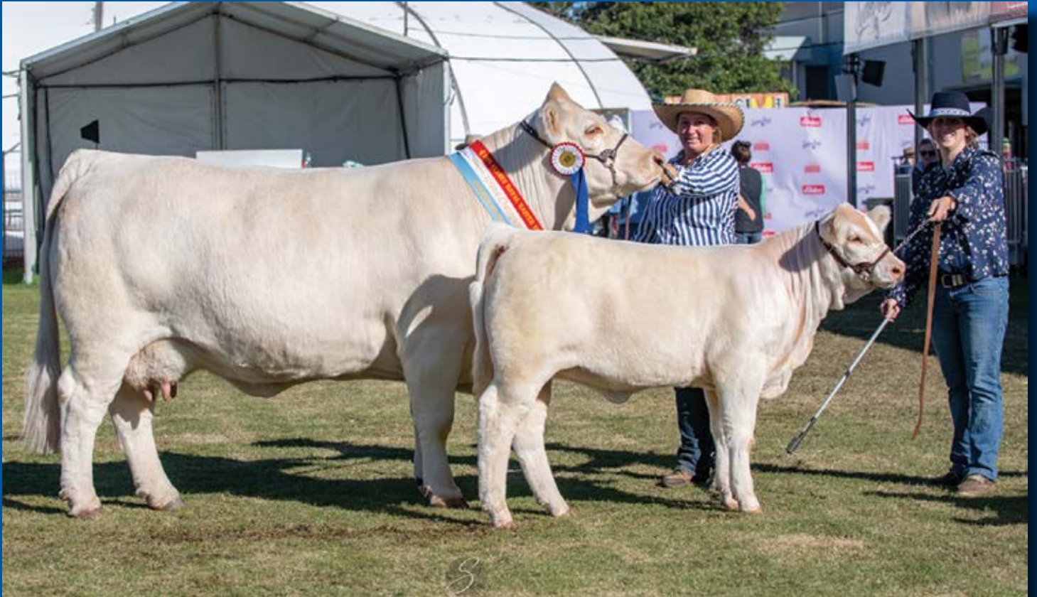
Wakefield Amaze 38 + calf Supreme Charolais Exhibit at Sydney Royal Easter Show 2023

18TH ANNUAL CHAROLAIS & ANGUS BULL SALE Friday 18th August 2023 at 1pm at "Wakefield", Wollomombi, NSW