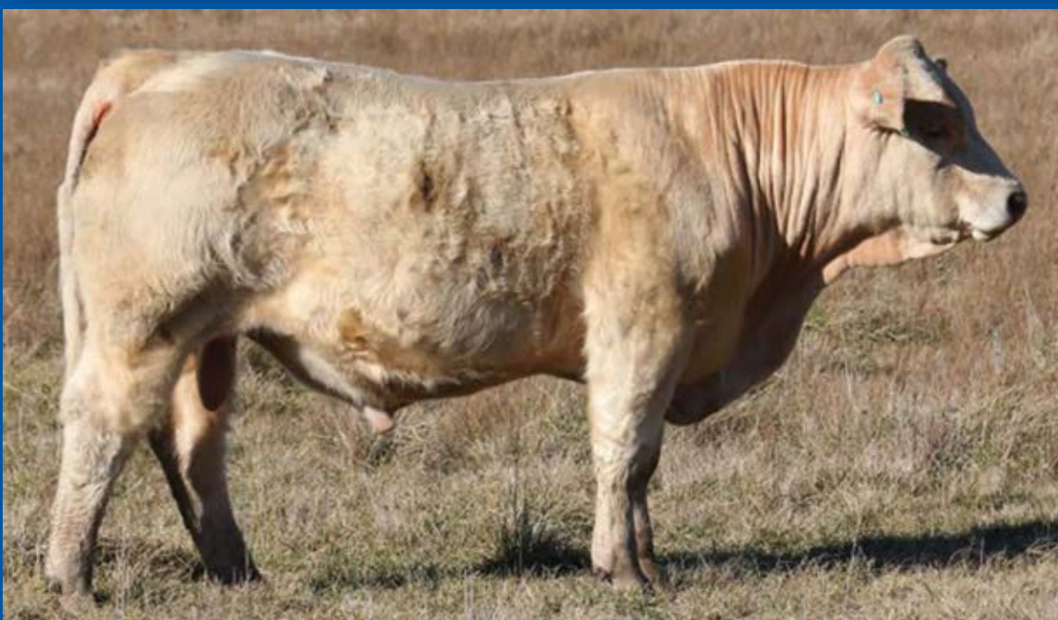
LOT 21 Wakefield Some Like It Hot (P) BIS S169E