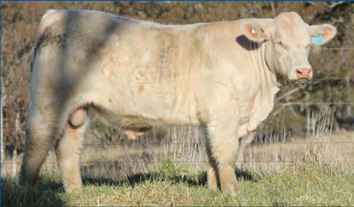
LOT 33 Wakefield Shaken Not Stirred (P) BISS150E