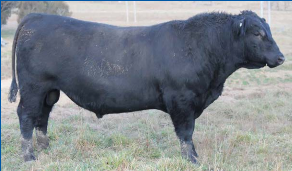
LOT 46 Wakefield Rainfall ANN21S752