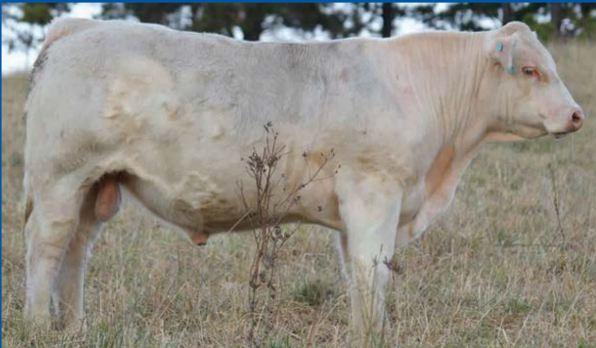
LOT 14 Wakefield Sylvester (P) BIS S87E