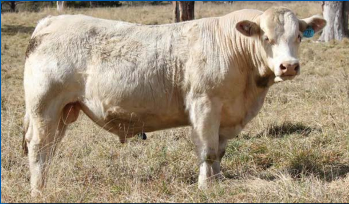
LOT 3 Wakefield Sub Zero (P) BIS S71E