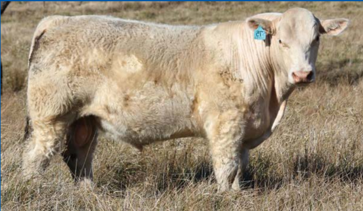
LOT 8 Wakefield Sure Bet (P) BIS S75E