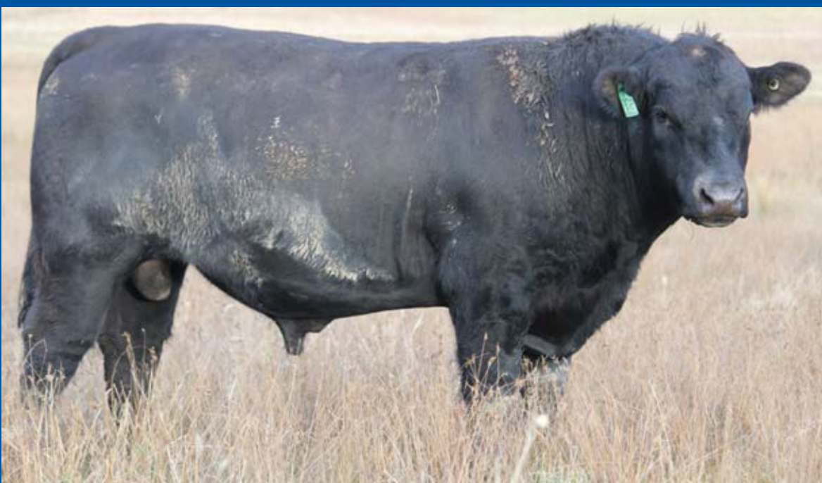
LOT 45 Wakefield 38 Special ANN21S794