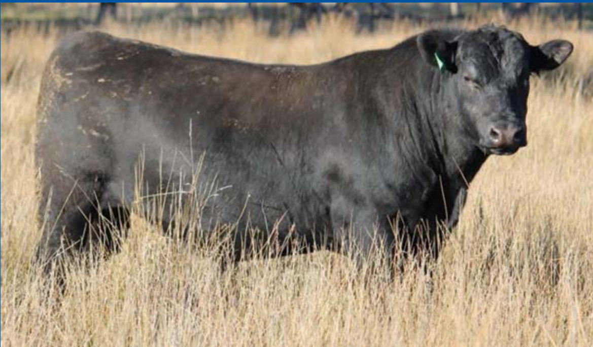
LOT 43 Wakefield Trailblazer ANN21S754