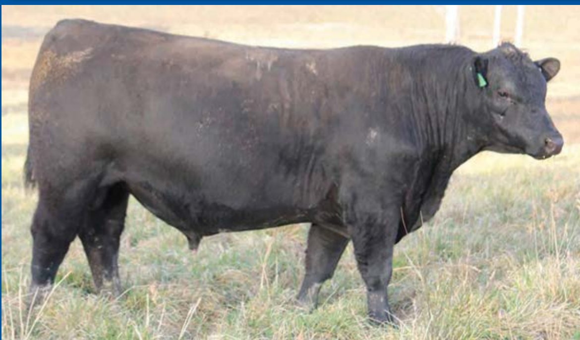
LOT 54 Wakefield Trailblazer ANN21S760