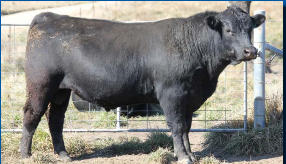
LOT 49 Wakefield Geddes ANN21S756