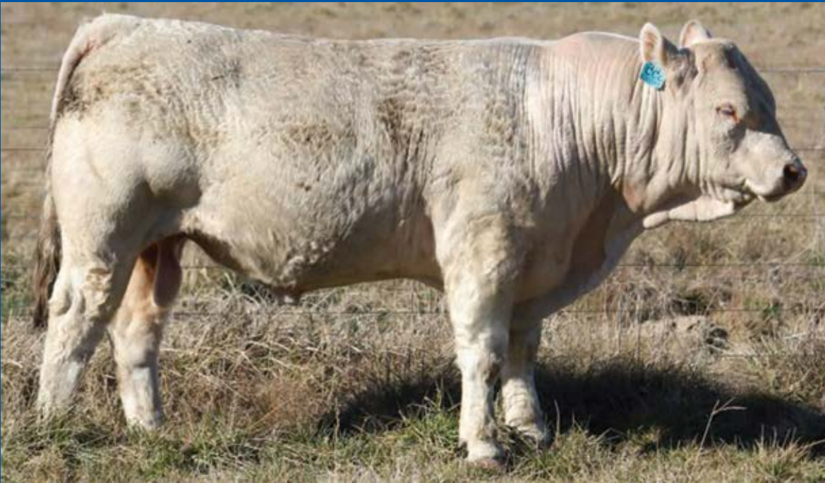
LOT 22 Wakefield Skyhooks (P/S) BIS S55E