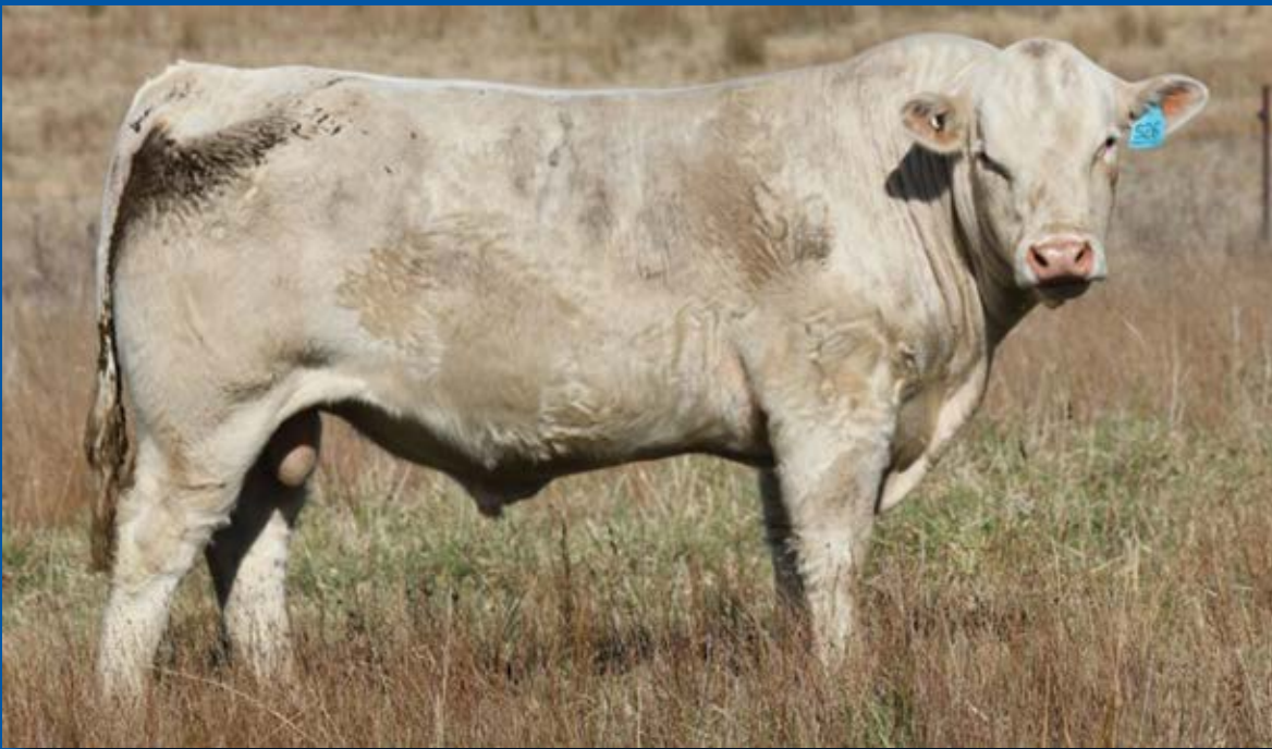
LOT 7 Wakefield Strut Your Stuff (P) BIS S26E