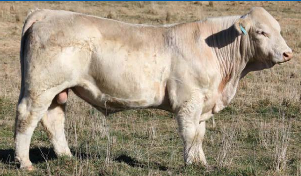
LOT 27 Wakefield Sundowner (P) BIS S69E