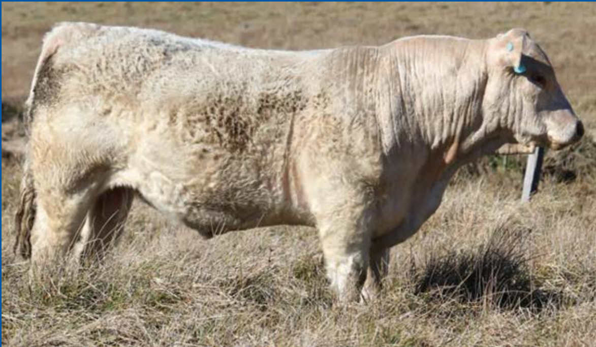
LOT 9 Wakefield Sherbet (P) BIS S34E